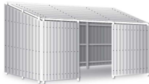
Easy Roofing Unit

(Caution: In principal, buildings made with simple pipe and clamp joints to not comply with building standard law.)